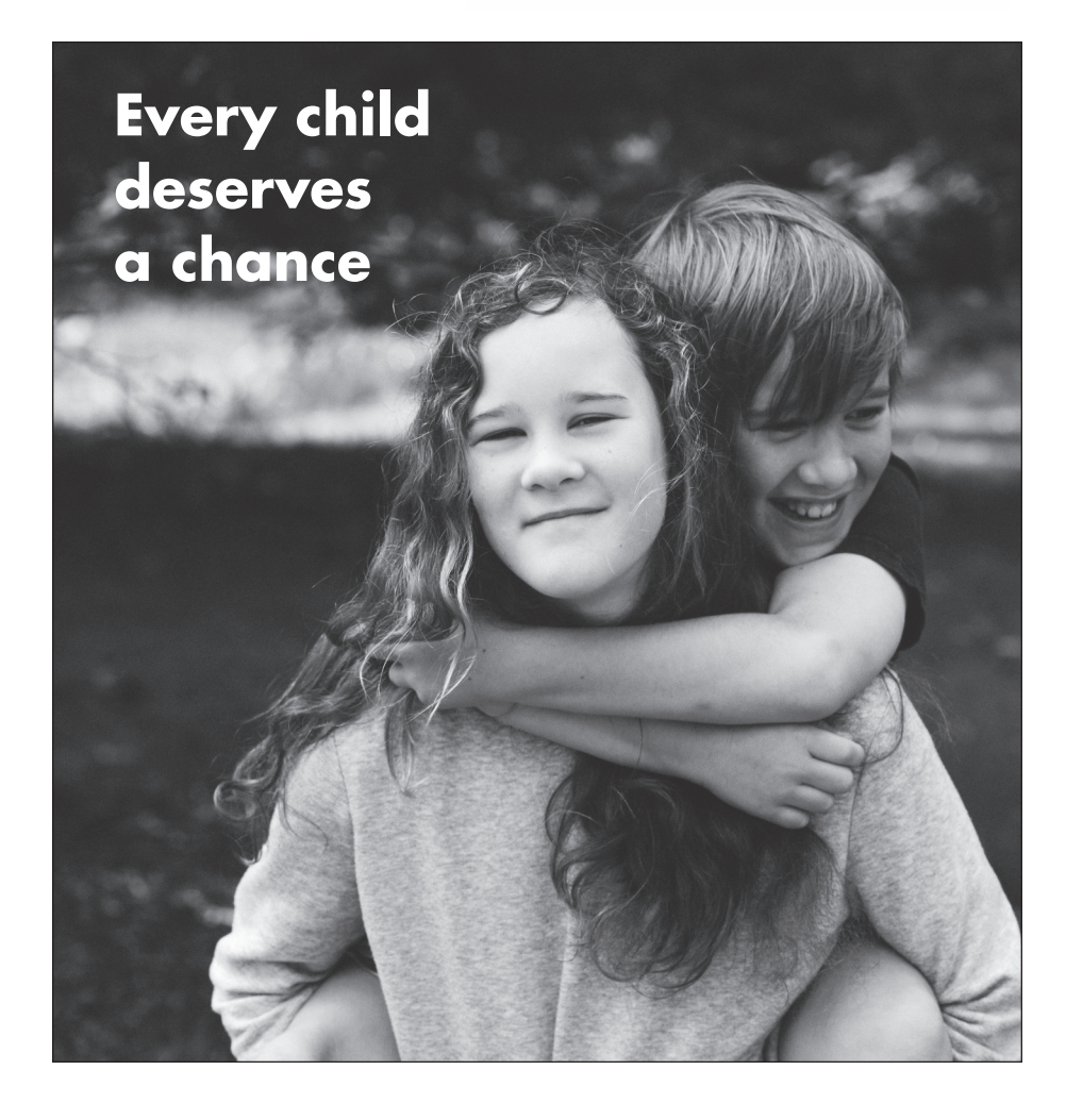
Methodist Home for Children Sunday